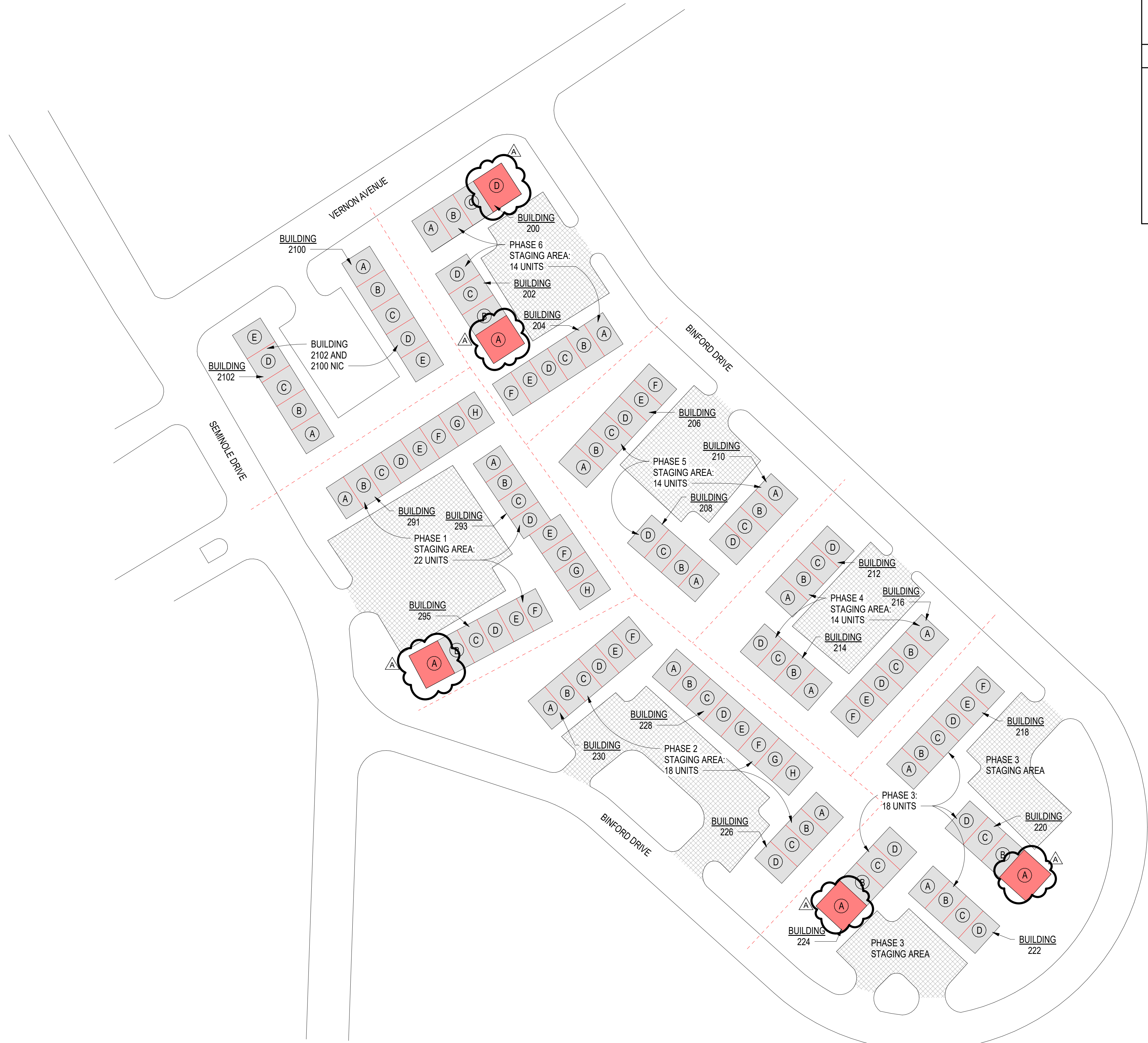
SITE PLAN ARCHITECTURAL SITE PLAN

3/18/2022 11:35:22 AM C:\Users\mark\Documents\HHA_LR_Patton_Repairs_V22_OF_ARCH_mark.blazer.rvt THE INFORMATION CONTAINED HEREIN IS THE EXCLUSIVE PROPERTY OF EDT-THA ARCHITECTURE, LLC AND IS TO BE PROTECTED UNDER COPYRIGHT LAWS. THE ORIGINAL IDEAS REPRESENTED HEREIN BY THIS INFORMATION SHALL NOT BE USED, ALTERED, OR REPRODUCED IN ANY MANNER WITHOUT THE EXPRESSED WRITTEN CONSENT OF EDT-THA ARCHITECTURE, LLC.